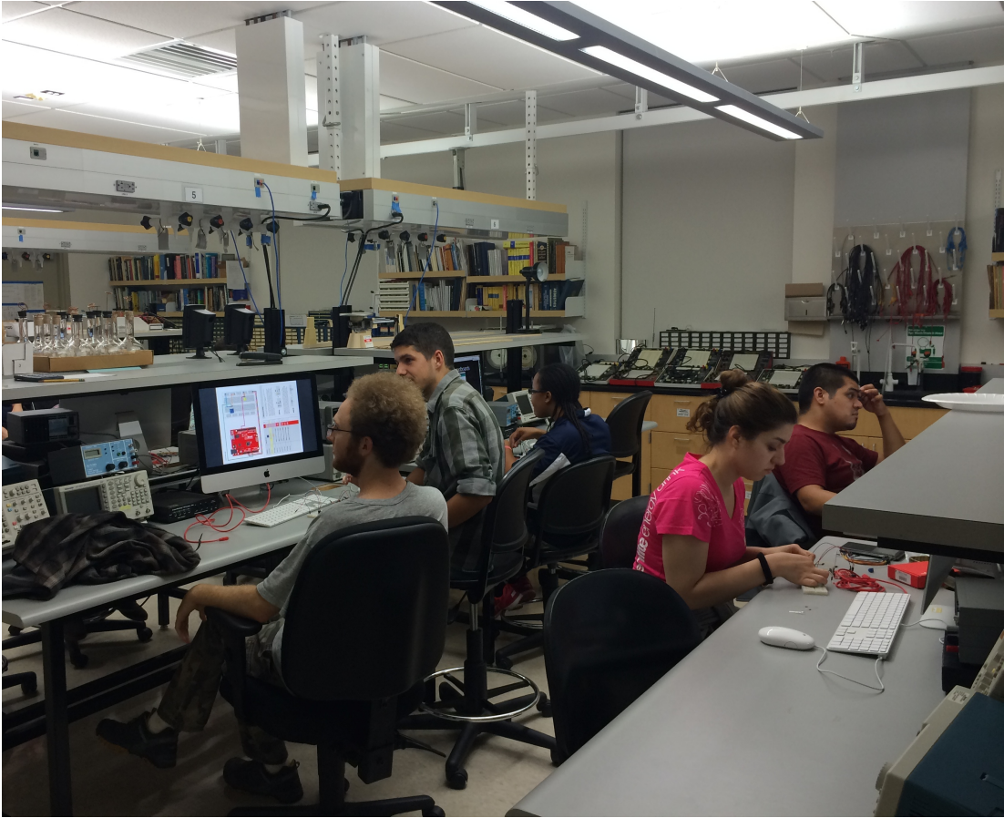
MESA/SPS Skills Lab (9/24/14):