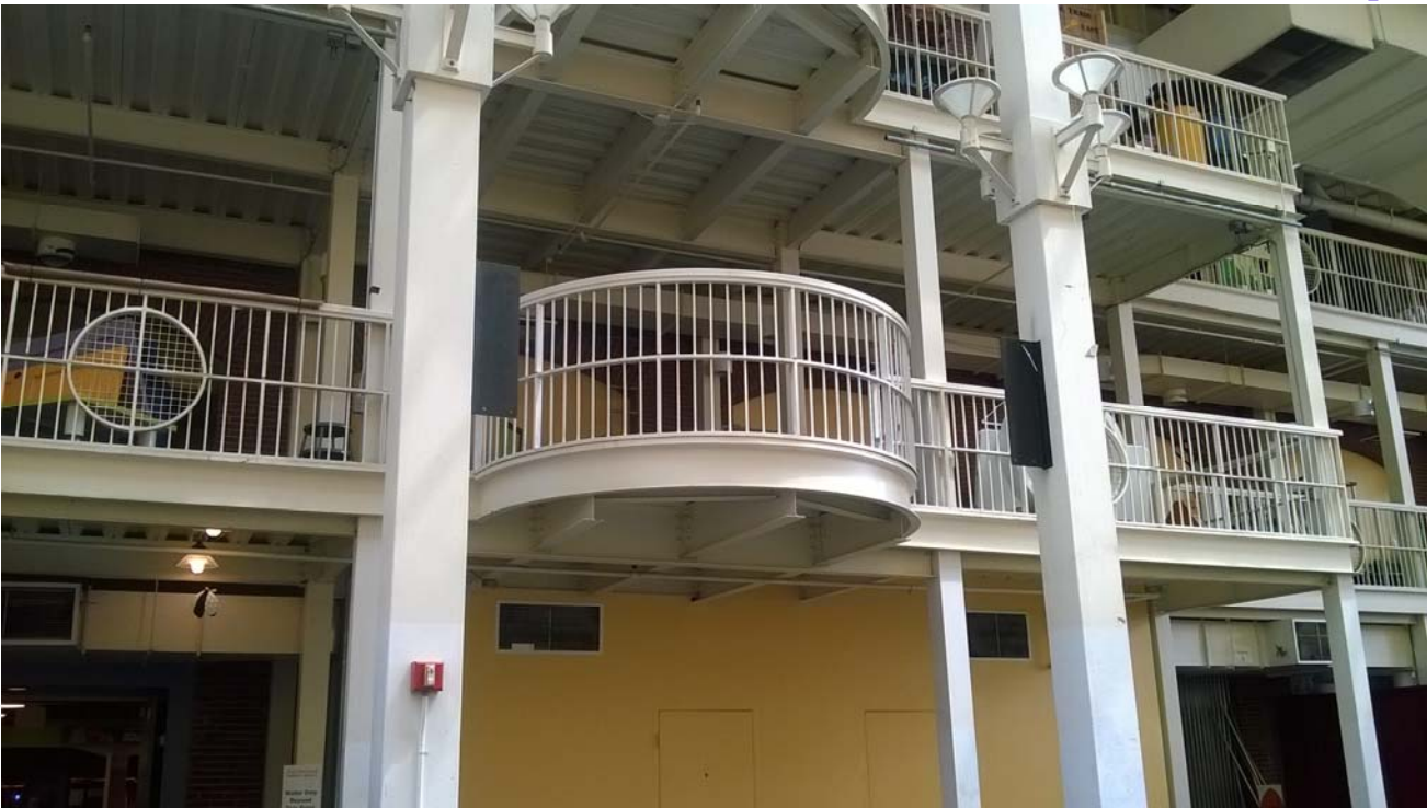
Figure 5: We plan on hanging our chime demo from this balcony. Visitors will immediately be greeted with the hanging chimes demonstration.