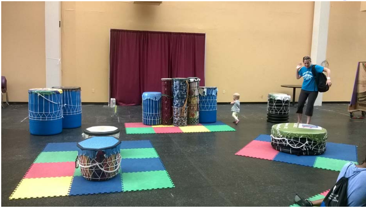
Figure 4: The rest of Percussion Garden, as it is now.