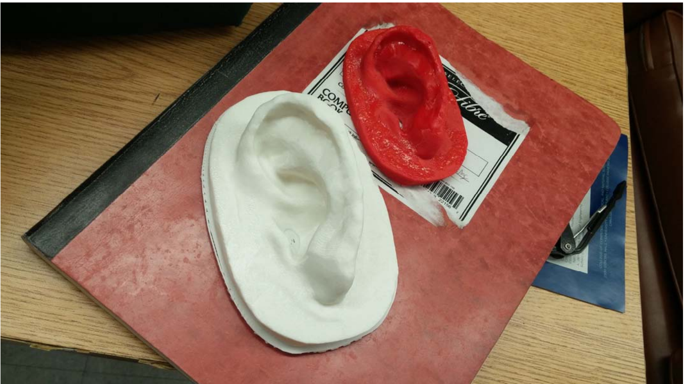
Figure 6: 3D-printed ears to be used for slinky/ear demo.