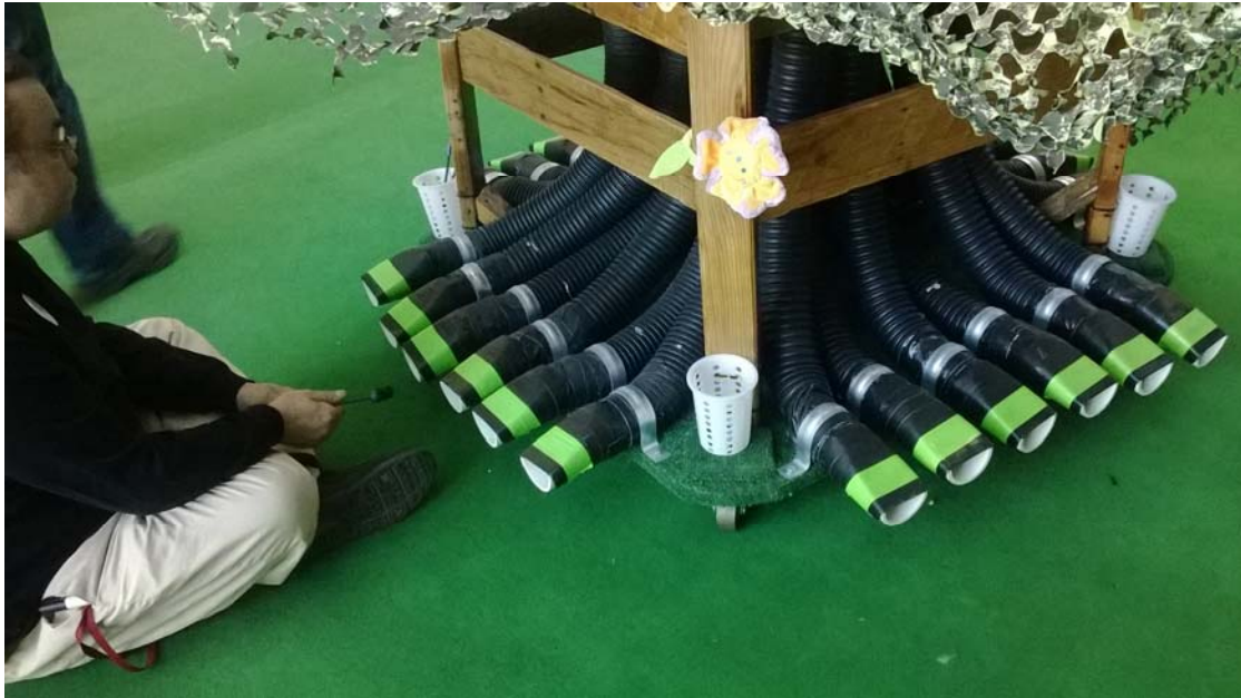
Figure 3: Percussion Garden Director Daveed Korup demonstrating the Tubulum Tree to visiting SPS members.