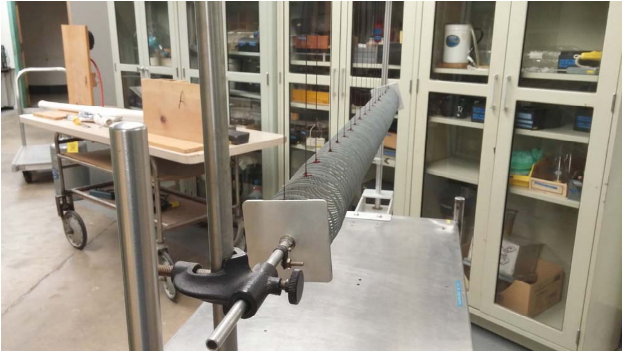
Figure 7: A prototype of the slinky for the slinky/ear demo.