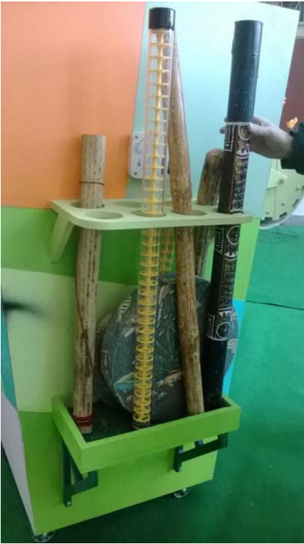
Figure 2: Rain sticks and Monsoon poles ready for play at the Percussion Garden.